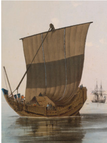
(From Perry Visits Japan)

Formed in 2001 as the production arm of the Library's Digital Services Department, the Center for Digital Initiatives focuses its efforts in several key areas: