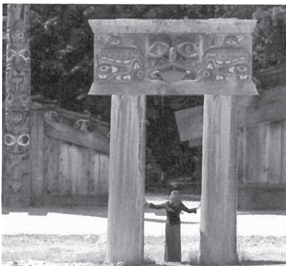
Haida double mortuary pole, located at the Museum of Anthropology