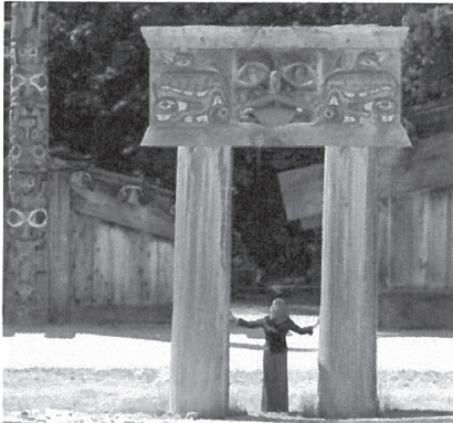
Haida double mortuary pole, located at the Museum of Anthropology