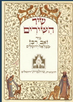
Title page of 'Shir ha-Shirim', Jerusalem