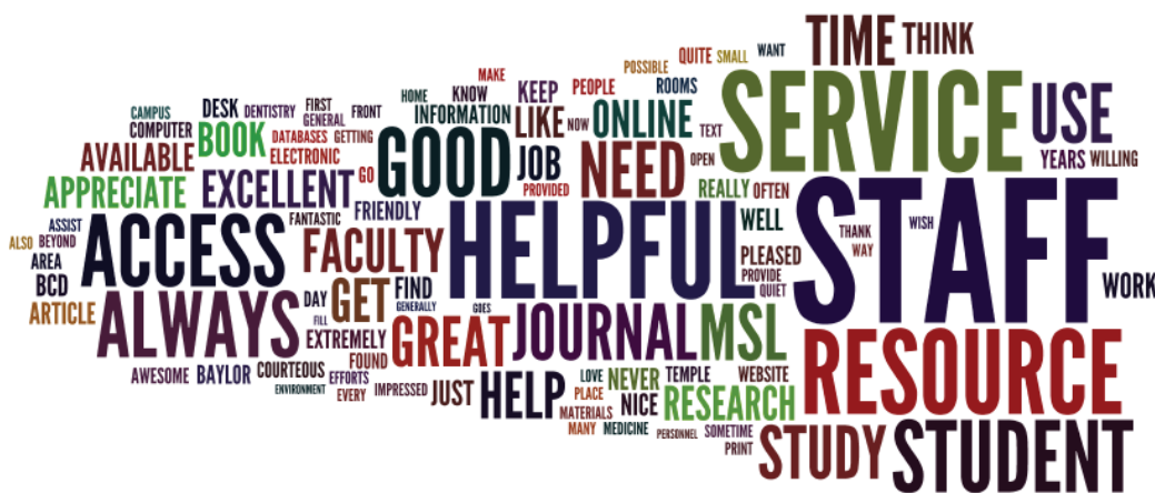
Figure 3.8.3.1. Word Cloud of 2010 MSL LibQUAL+® Customer Service Comments

The following graphic, using the Wordle™ software, displays most prevalent words found in TAM HSC user comments from the 2010 MSL LibQUAL+® comments on MSL customer service.