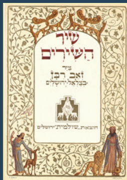
Title page of 'Shir ha-Shirim', Jerusalem