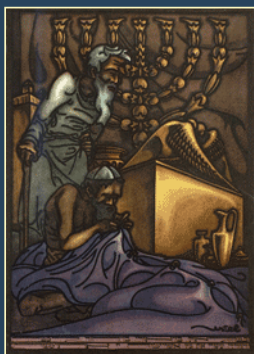
Page from 'Moses'; Wien, 1924