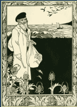
A page from 'Lieder des Ghetto', Berlin, 1902; illustrated by E. M. Lilien